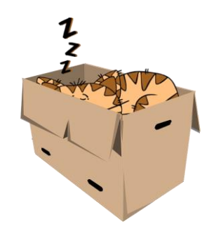
3. Cat is sleeping <u>inside</u> the box.

1. Cat is sleeping on the pillow. 2. Cat is playing with the wool.