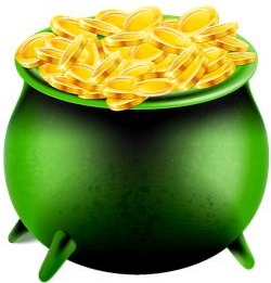
Pot of gold