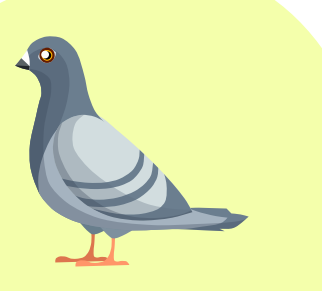
This is a pigeon.