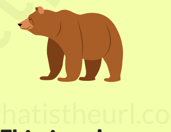
This is a bear.