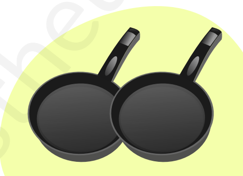
These are pans.