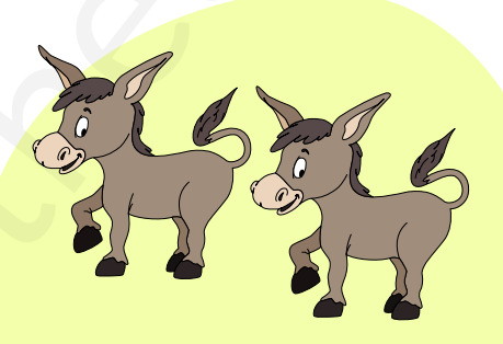
These are donkeys.