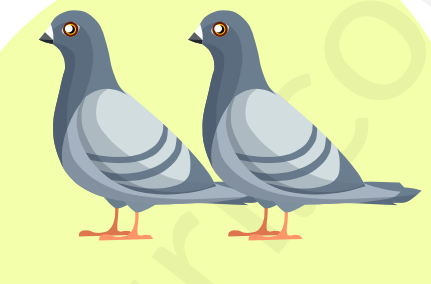
These are pigeons.