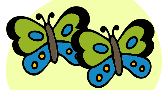
These are butterflies.