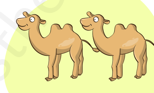
These are camels.