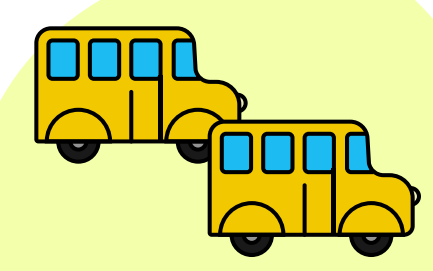
These are buses.