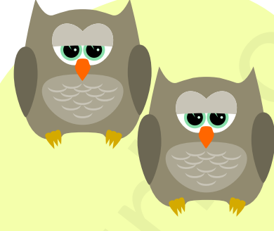
These are owls.